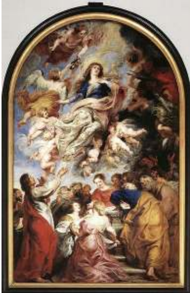
Baroque Rubens Assumption-of-Virgin

I have taken the liberty and the opportunity to include a brief history of this feast and hope that it provides some